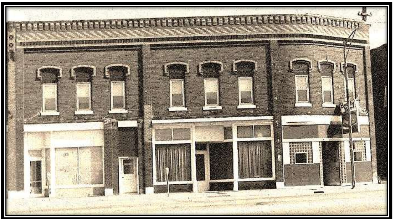
Taken during a State of Michigan Survey in 1975, the south half of the double building located on the 100 Block of South Stephenson Avenue shows 115 South Stephenson Avenue and other addresses before the remodeling was done for the Brave Bull, Geline’s Rib Cage and Fontana’s Supper Club.