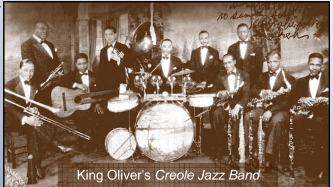
King Oliver's Creole Jazz Band