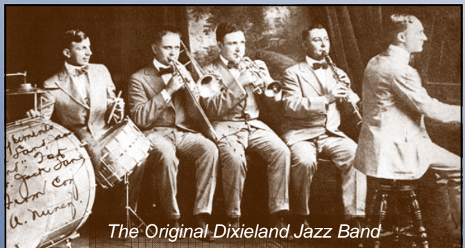
The Original Dixieland Jazz Band