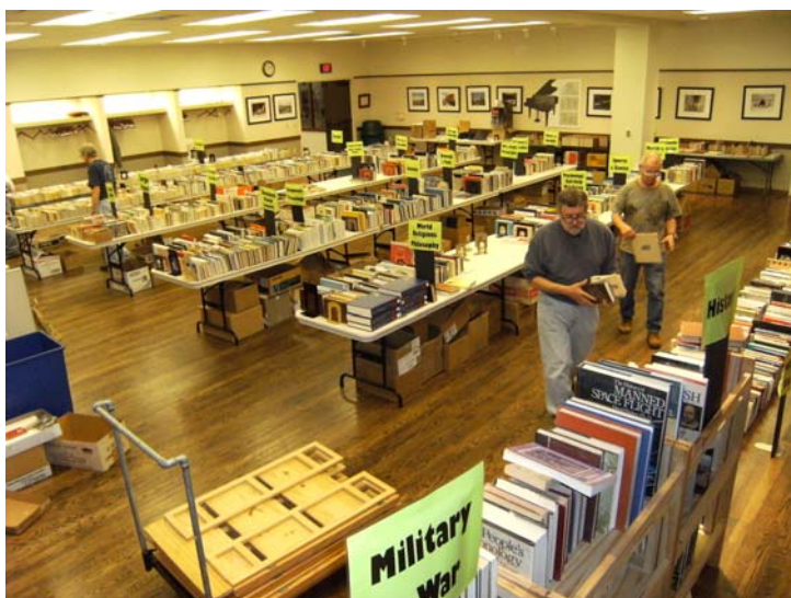
Friends volunteers help set up for the used book sale in the Community Room in June. The Friends raised over $2,800 to benefit PWPL programs and collections.